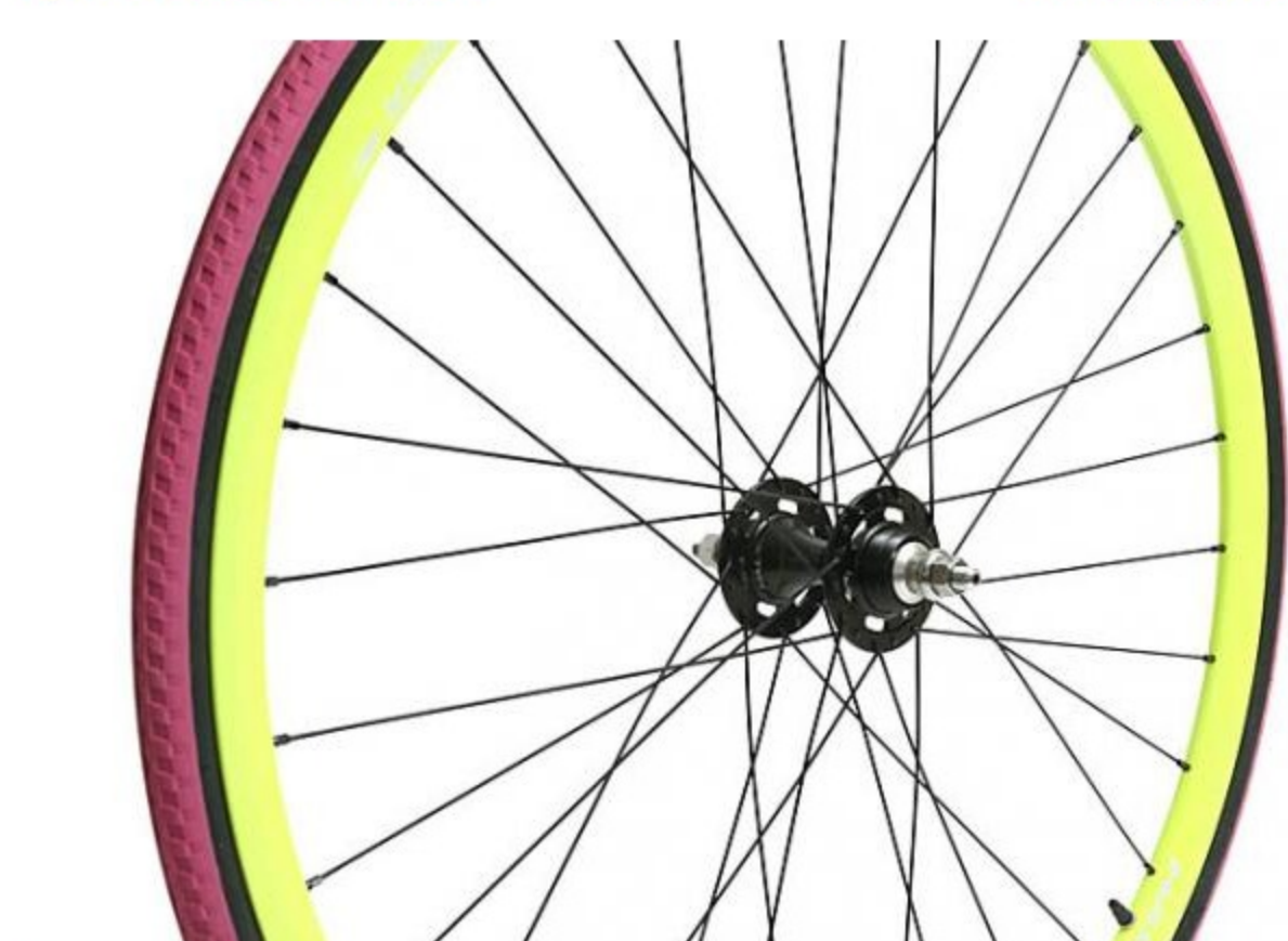
Halo Aerotrack wheelset

With super smooth hubs and superb lateral stiffness, Halo's Aerotrack wheels are undeniably fine, bombproof wheels for daily road and/or winter service but weighing 993g and 1030g (front and rear respectively) you wouldn't put them on a lithe track or TT mount.